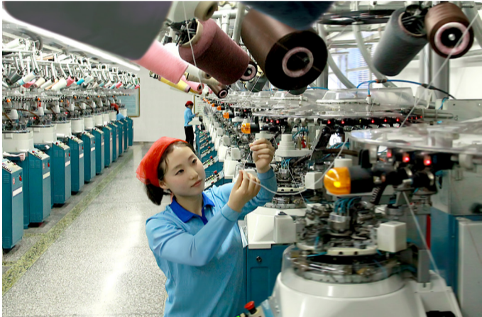
Upsurge is brought about in production at factories and complexes of several sectors including the Taean Heavy Machine Complex (left) and the Pyongyang Hosiery Factory.