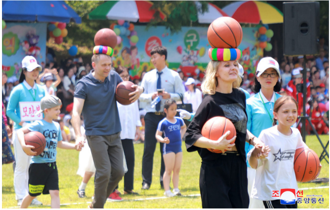
A joint friendship gathering takes place at the Taesongsan Pleasure Ground in Pyongyang on June 1, the 75th anniversary of June 1 International Children's Day.

The lively looks of the children who displayed competitive spirit in the sports and amusement games, which were held divided into "Squirrel" and "Hedgehog" teams, and their parents' enthusiastic cheers added to the pleasure on the holiday.