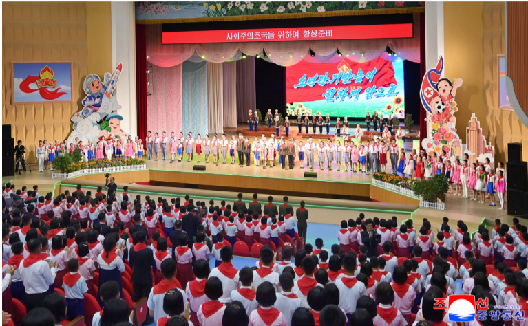
The schoolchildren's stage of pride "March forward dynamically under the unfurled flag of the Children's Union" is held at the Mangyongdae Schoolchildren's Palace on June 5.