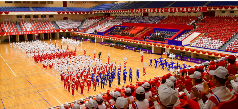
Sports and amusement games of the participants in the celebrations of the 79th KCU anniversary are held at Pyongyang Indoor Stadium on June 5.