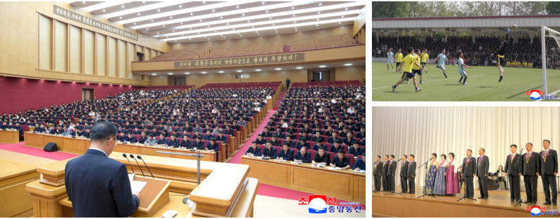
Various political and cultural activities are conducted on the occasion of the first anniversary of the inauguration and opening of the Central Cadres Training School of the WPK.

Meanwhile, Party schools at all levels in the capital and local areas held seminars for grasping the leadership exploits of the respected General Secretary who set forth important guidelines for training Party cadres in the new era and other political and cultural events including exhibitions of educational and scientific achievements and sports games.