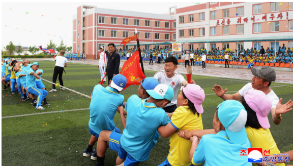
Members of the Korean Children's Union throughout the DPRK celebrate the 79th KCU birthday significantly.