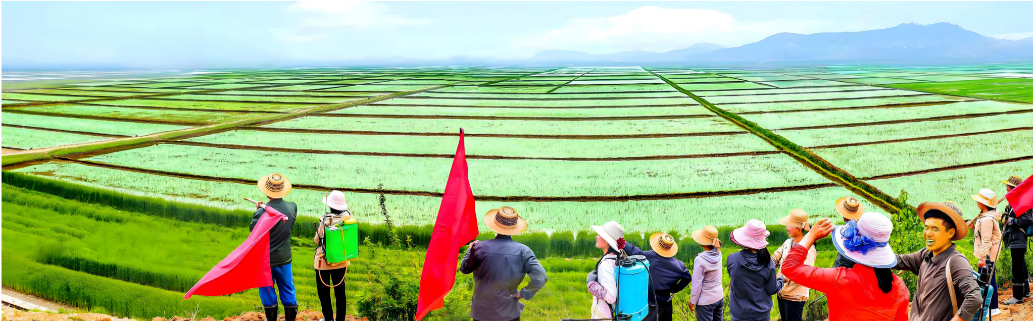
Agricultural workers complete rice transplanting in the Simphyong Farm under the South Hwanghae Provincial Rural Economy Committee.

demands that farms tend rice seedling beds carefully to grow healthy rice seedlings. After finishing their campaign, an increasing number of farms are now helping others with their rice transplanting. North Hwanghae, Kangwon and other provinces have also achieved good results in rice transplanting.