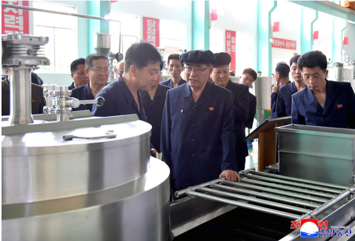
Premier Pak Thae Song (centre) learns about manufacture of equipment at the Pyongyang Construction Machine Factory.

equipment and materials necessary for the construction of the city of Samjiyon in a responsible manner and step up the finishing work in a