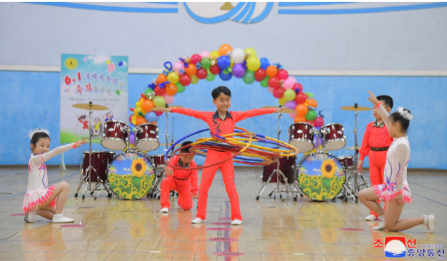
A meeting of children with disabilities is held at the gymnasium of Taedonggang District Extracurricular Sports School in Pyongyang on June 1 to mark June 1 International Children's Day.