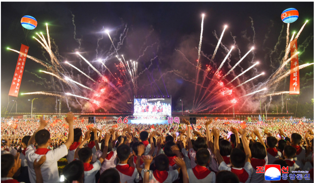
A gala evening of schoolchildren takes place in front of the Mangyongdae Schoolchildren's Palace on the evening of June 6.