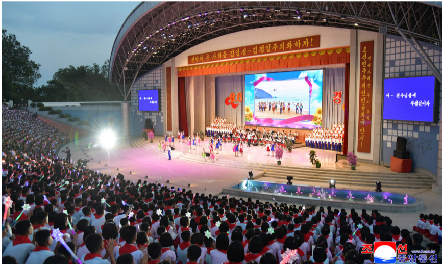
Schoolchildren's art performance "Let us be always ready for the socialist country" is given at the Pyongyang Municipal Youth Park Open-Air Theatre on June 5.

anniversary of the KCU, members of the delegation of Korean schoolchildren in Japan and other schoolchildren. Put on the stage, which began with prologue "March of the Children's Union", were colourful numbers showing the bright and cheerful appearance of schoolchildren growing up to be reliable pillars of socialist Korea under the warm care of the motherly Party.