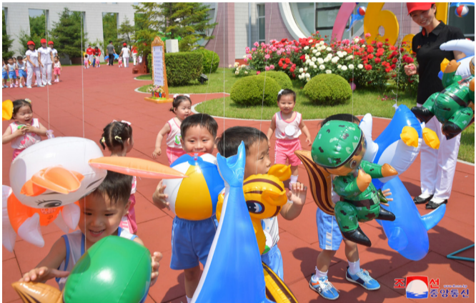
The children celebrate June 1 International Children's Day with great joy at Pyongyang Baby Home (left) and Kyongsang Kindergarten (below).

general inclined shaft of the Anju Area Coal-mining Complex and the Namchil and Songhak farms in the city of Anju.